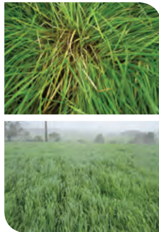
Figure 1 Cut pastures early