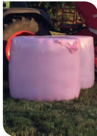
Figure 8 Silage bales