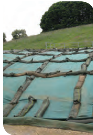
Figure 7 Sealing stacks with bags