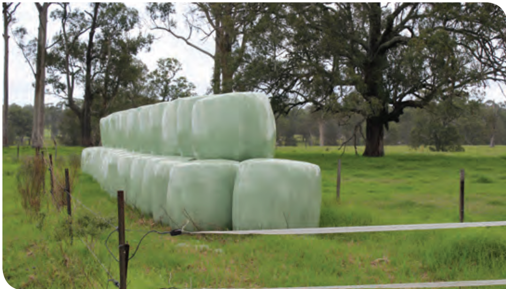
Figure 6 Wrapped silage bales